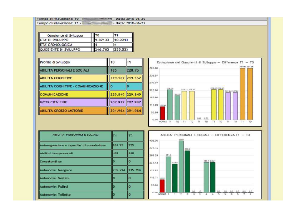
Figure 3: The Data Report Panel.

It is worth noting that such a panel organization is hard to reproduce by using classical software tools such as spreadsheets, because of the huge amount of data to be handled and the continuous adaptations of the program to the specific needs of the children unrolled under the curriculum.