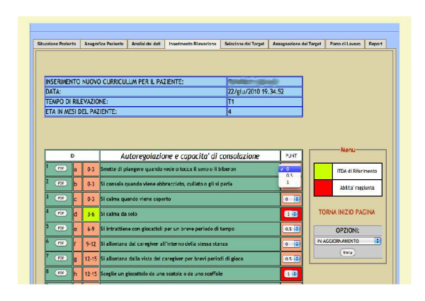
Figure 2: The new child curriculum panel.

It is worth noting that such a panel organization is hard to reproduce by using classical software tools such as spreadsheets, because of the huge amount of data to be handled and the continuous adaptations of the program to the specific needs of the children unrolled under the curriculum.