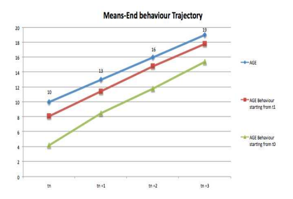
Figure 6: Comparison between development trajectory of children unrolled under the curriculum for different time. The ordinate axis give the development age.

time T_0 or T_2 As it is shown in Figure 6, the development trajectory of the children that have been unrolled under the curriculum for more time, it is much more close to that one related to those children that have been unrolled under the curriculum from less time. This at any fixed age.