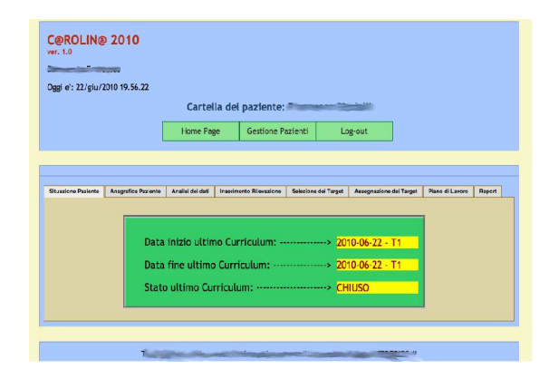
Figure 1: The ERP along with its eight panels.

As it is well known by medical expertises, the appropriate use of the Carolina Currriculum is based on the following main steps: (i) Determine initial children status, (ii) Plan the right program and implement it, (iii) possibily, change the program according to the ongoing collection of data. These steps are implemented by using a simplified Elettoronic Patient Record (ERP), as we have implemented (see Figure 1). The ERP is composed of eight panels, which allows to make, in a sequential way, the following main tasks required by the Carolina Curriculum: preliminary evaluation , data store , data analisys , program plan .